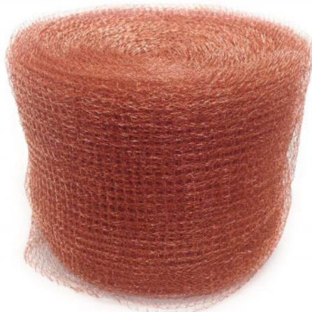
100 Foot Roll